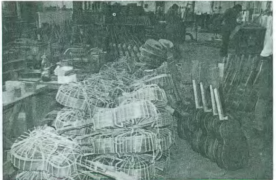
The daily quota is around 150 guitars. Note pear-shaped bandurrias in center background.

As for the finishing of instruments, this too has been mechanized with the spray gun replacing the traditional brush and French polish. Also in line with the larger production scale, the Tatays are now ordering custom-made rosettes from Japanese specialists rather than making their own.