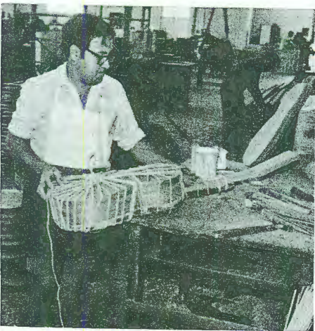
Fastening down freshly glued back with cotton cord.