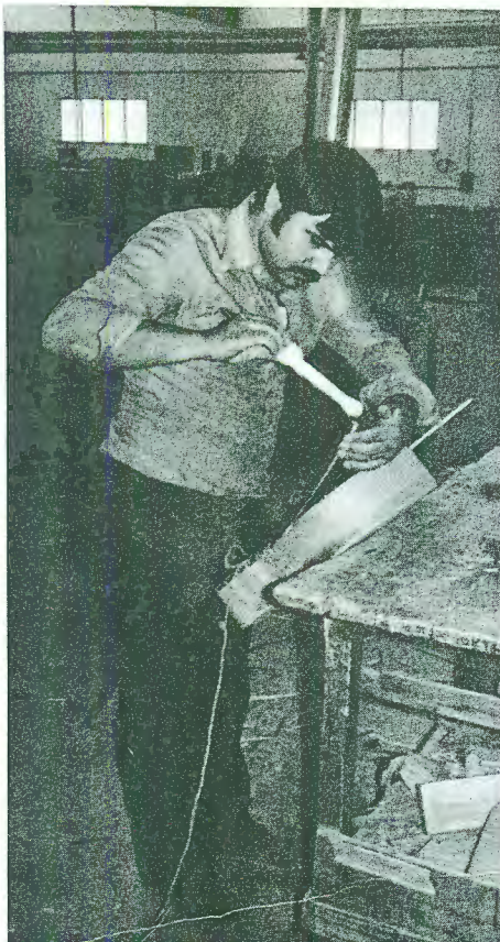
Gluing down purfling with conventional white glue.