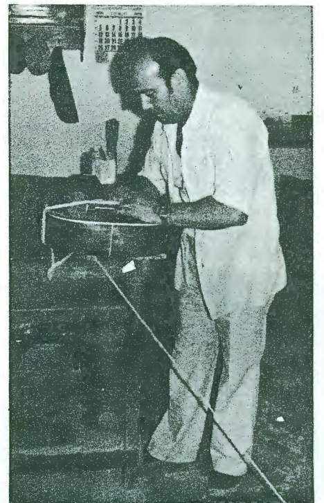
Rather than using clamps, this worker uses cotton cord and small wooden wedges to hold bridge in place during the gluing process. He can fasten two or three bridges per minute in this fashion.